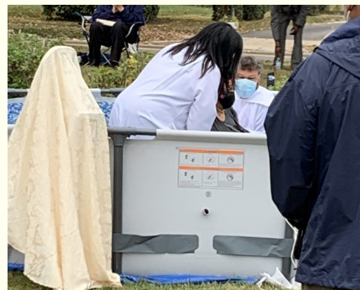
Outdoor baptism at College Hill, October 11, 2020

"In happy moments, PRAISE GOD . In difficult moments, SEEK GOD . In quiet moments, WORSHIP GOD . In painful moments, TRUST GOD . Every moment, THANK GOD ." Rick Warren